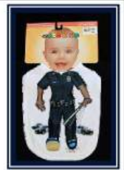
Baby Bib "Just Add A Kid" (UPC 745girlbib) $8.95