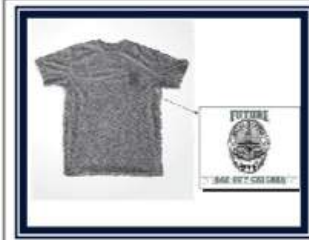
LAPD T-Shirt "Future Bad Guy Catcher" (UPC RA5101YOUTH) $9.95