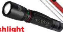
ASP Flashlight Rechargeable (UPC 092608356252)