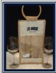
LAPD Wine Bag "2-bottle" (UPC 10006) $14.95