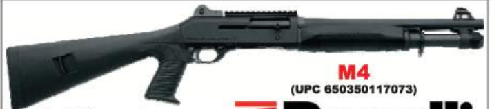
M4 (UPC 650350117073)