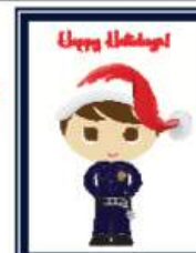
Holiday Cards "Includes 8 cards w/envelopes" (UPC 012109-01210) $9.99/set