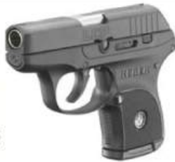
LCP 380 (UPC 736676037018)