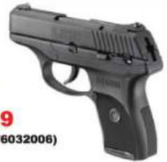
LC9 (UPC 736676032006)