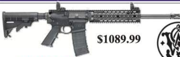
MP 15T CA (UPC 022188145694)

1880 NORTH ACADEMY DRIVE LOS ANGELES, CA 90012 LOCATED INSIDE THE ELYSIAN PARK TRAINING FACILITY