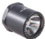
LED Conversion Head (UPC 084871315265)