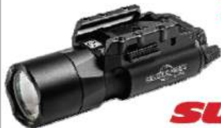
X300UA Weapon Light (UPC 084871310772)