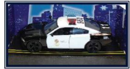
LAPD Police Car (UPC 76400)