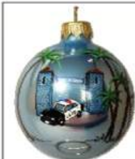
LAPD Ornament Glass (UPC 842389019576) $24.95