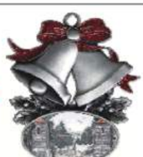
LAPD Ornament Police Academy (UPC XM42) $6.95