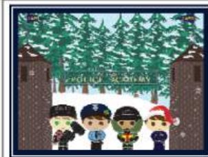
Holiday Cards "Includes 8 cards w/envelopes" (UPC 01208) $9.99/set