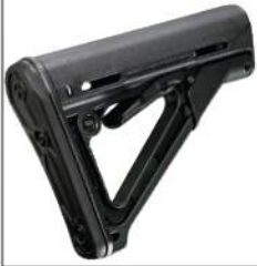
CTR Stock (UPC 873750001548)

LAPRAAC 1855 ACADEMY DRIVE LOS ANGELES, CA 90012 LOCATED IN THE ELYSIAN PARK POLICE ACADEMY (FORMERLY CLASSROOM #2)