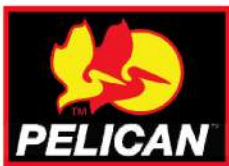
iPad Case (UPC 019428105181)