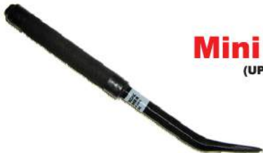
Mini Breacher (UPC SPMINIBRBLK)