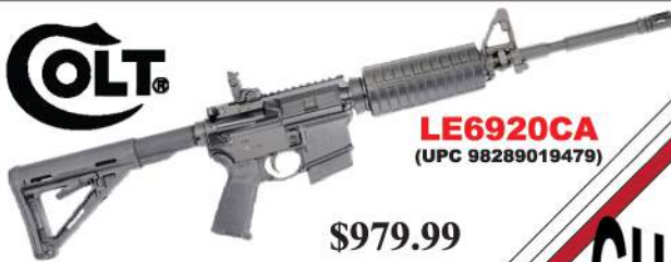
LE6920CA (UPC 98289019479)