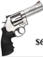
686 357 Mag (4") (UPC 022188642223)