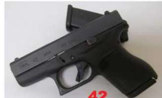
42 (UPC 764503910609)