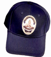
LAPD Hat with Badge