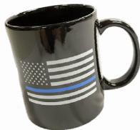
Blue Lives Mug