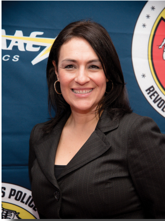
Bench Press Competition April, Friday the 13th to some may be considered a bad luck