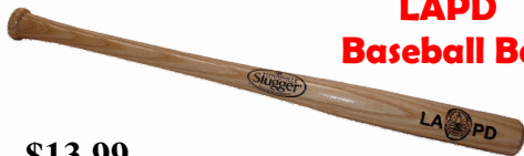
LAPD Baseball Bat