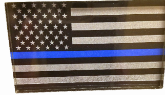
Blue Lives Flag