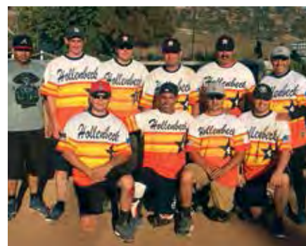
RED DAVIS "A" FLIGHT SOFTBALL CHAMPIONS HOLLENBECK