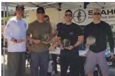
1st Place - Patrol Division Olympic GED.