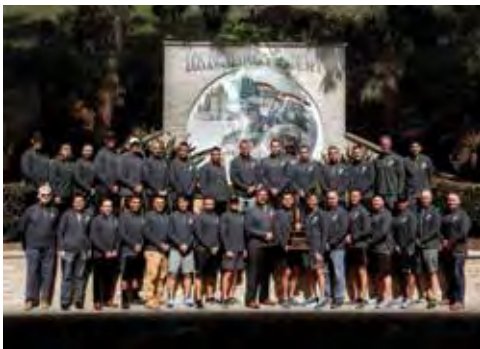
LAPRAAC TROPHY B2V LAPD RUNNING TEAM