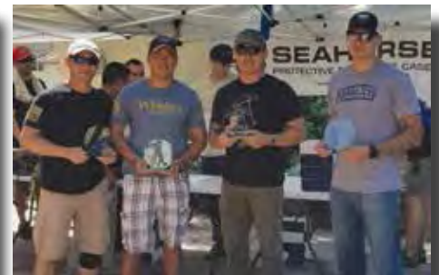
3rd Place - Open Division Metro Mixed