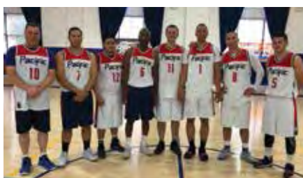
ID Basketball "B" BASKETBALL CHAMPIONS PACIFIC