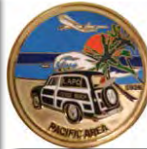
BOB BURKE TROPHY PACIFIC AREA