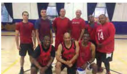
ID Basketball "D" BASKETBALL CHAMPIONS WILSHIRE