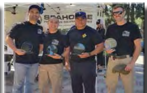
3rd Place - Patrol Division Newton Gangs