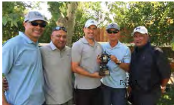
GOLF CLUB TEAM NET CHAMPIONS WEST VALLEY