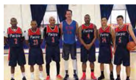
ID Basketball "A" BASKETBALL CHAMPIONS PACIFIC