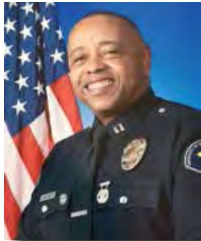
HALL OF FAME INDUCTEE ED PALMER