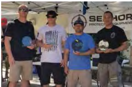
1st Place - Open Division Metro "G"

SHOT Show 2019 is around the corner and we are getting ready to launch a series of videos via Facebook and YouTube to keep track of all the latest gear being released. Until then keep shooting and stay safe.