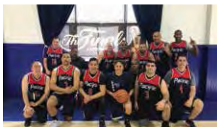
ID Basketball "C" BASKETBALL CHAMPIONS PACIFIC