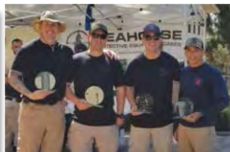
2nd Place - Patrol Division Southeast GED