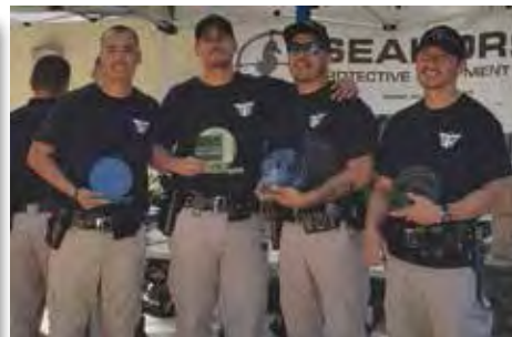
2nd Place - Open Division Metro CIT