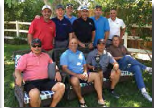
GOLF CLUB TEAM GROSS CHAMPIONS FID