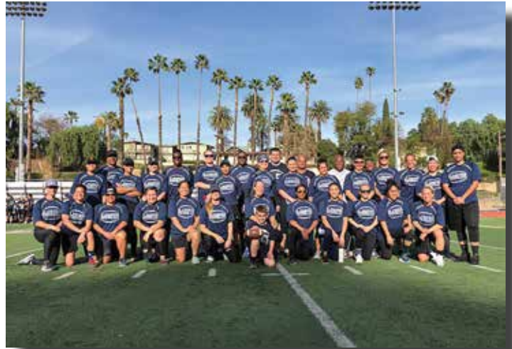
LAPD Women Flag Football Team