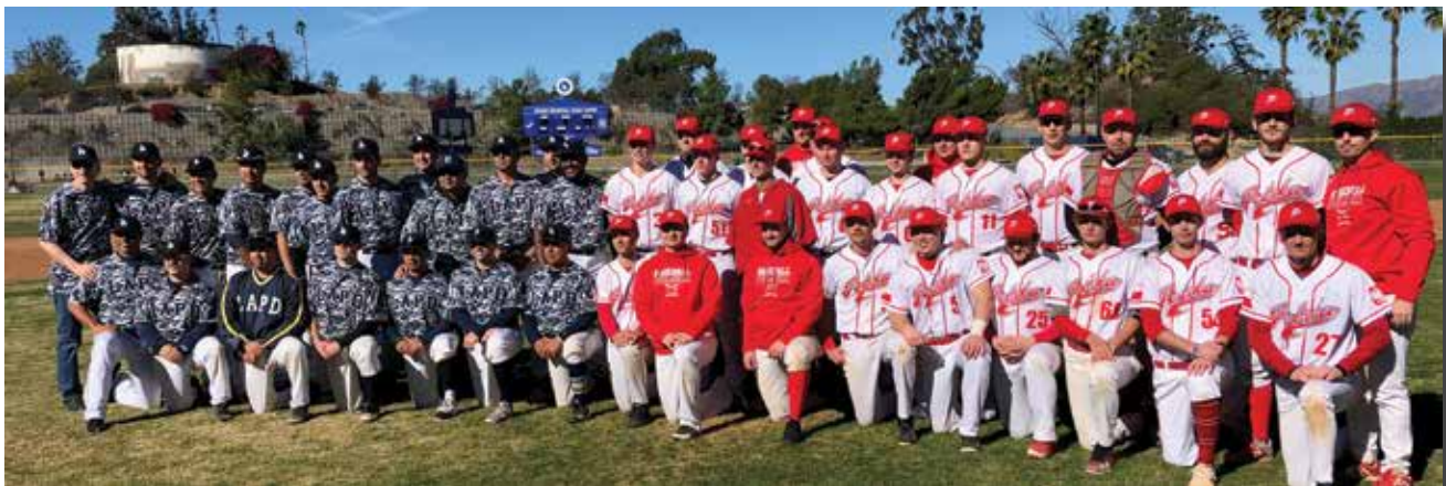
LAPD Baseball Team