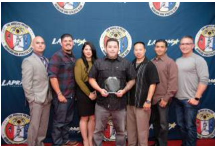
LAPRAAC TROPHY PADDLING PIGS