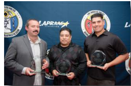
TEAM GROSS CHAMPION CENTRAL DIVISION