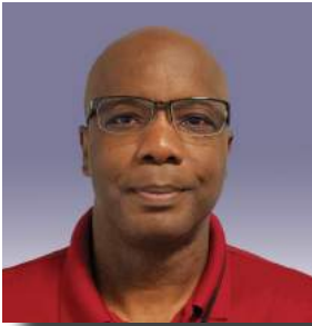
HALL OF FAME INDUCTEE EDMUND RUSSELL