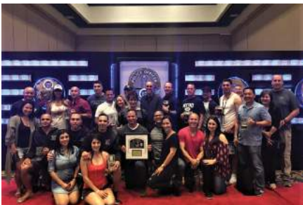
BAKER TO VEGAS AWARD METRO B2V TEAM