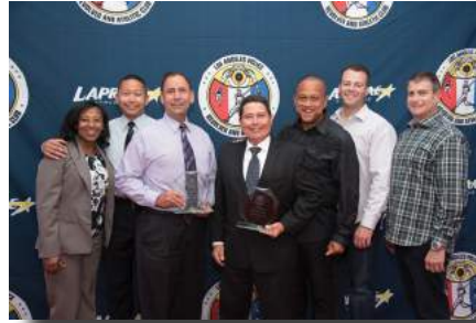
CHIEF'S AWARD LAPD TENNIS TEAM