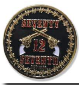
BOB BURKE TROPHY 77TH STREET AREA